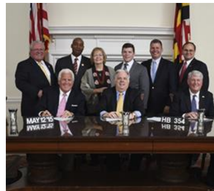
SB 354, Bill Signing, May 12, 2015